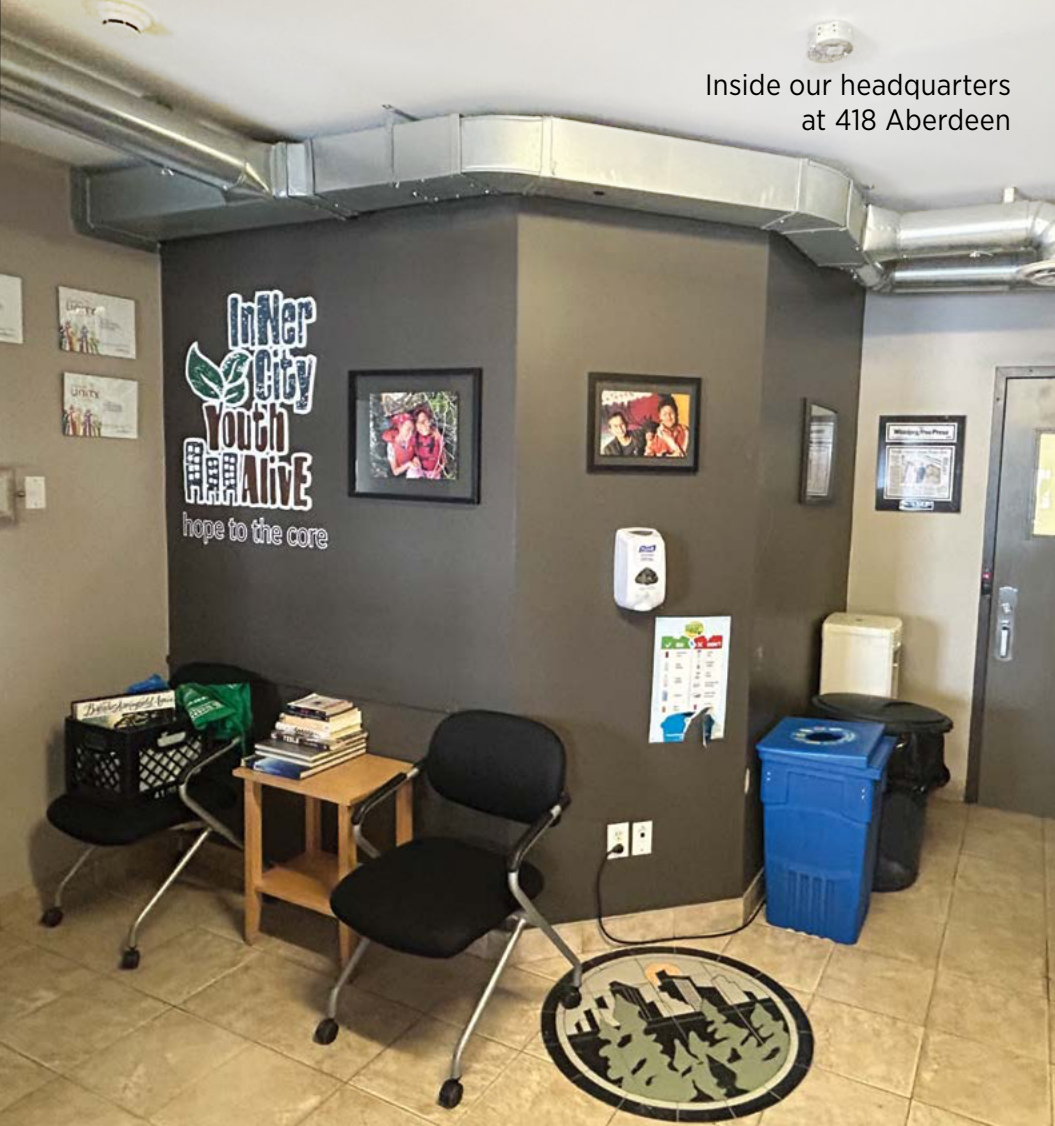
Inside our headquarters at 418 Aberdeen